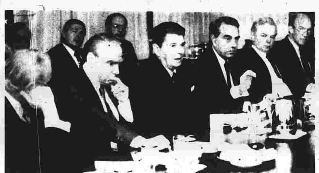
Seeking bipartisan support as he prepares for the summit, President Reagan meets with Congressional leaders Tuesday. From left are House Minority Leader Robert Michel; Rep. James Wright, D-Tex.; the president; Senate Majority Leader Robert Dole; Senate Minority Leader Robert Byrd, and Sen. Alan Simpson, R-Wyo.