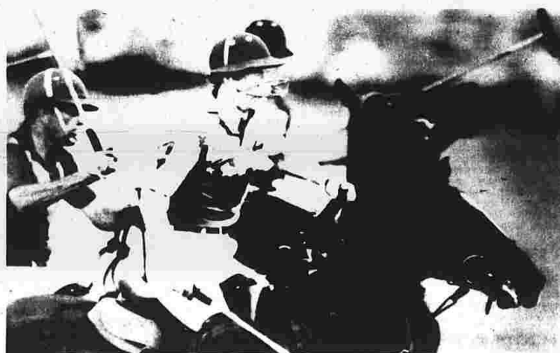
Intensely is reflected in the face of Prince Charles as he competes in a polo match Tuesday at the Palm Beach Polo and Country Club in Florida. His team won the trophy, but his wife won the affection of the royal couple's followers.